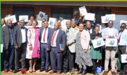
The Official Handover of ICT School Library Resources