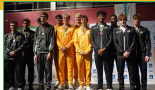
2023 SA National Swimming Championships