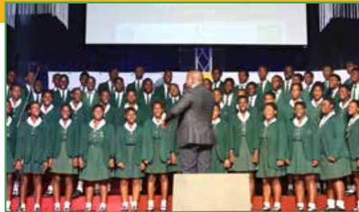
MEC Attends KZN 2023 Provincial ABC Motsepe SASCE Competition