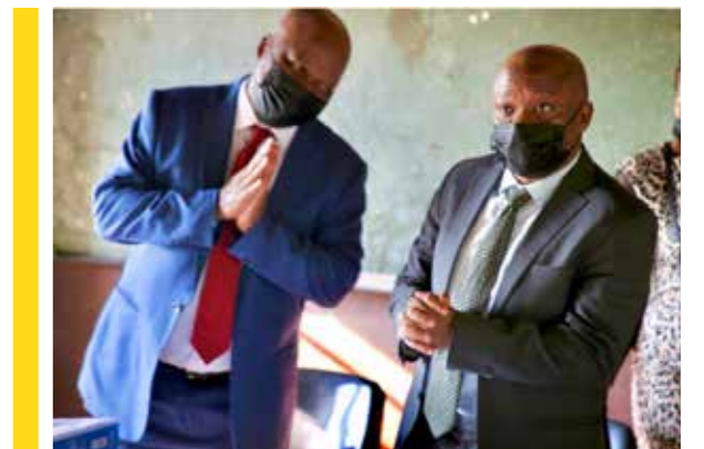
The Premier and HoD at the briefing in Ward 9 Magojolo Primary School