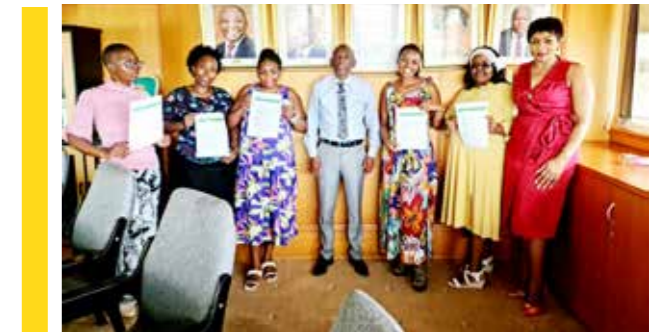
Umlazi District, welcoming the social workers from DSD