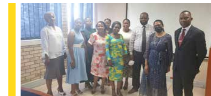
Ilembe District, welcoming the social workers from DSD