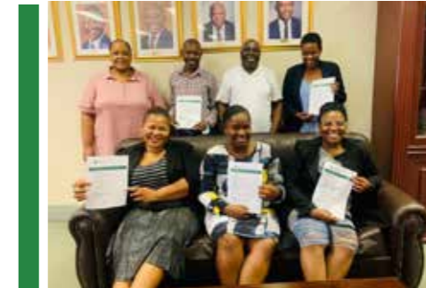
Umgungundlovu District, welcoming the social workers from DSD