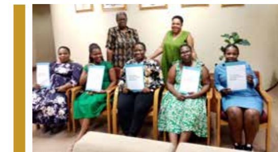
Zululand District, welcoming the social workers from DSD