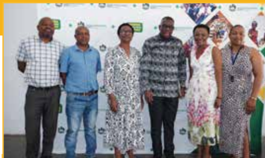
Matric Spring Camp - Class of 2023, Mimosadale Education Centre, Escourt