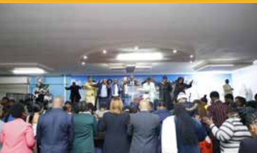
2023 NSC Examinations Provincial Prayer at Ethekewini Community Church