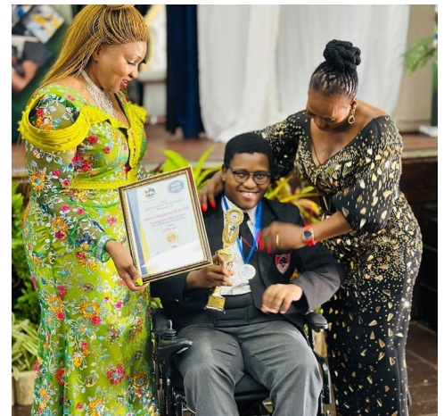
2024 MATRIC AWARDS