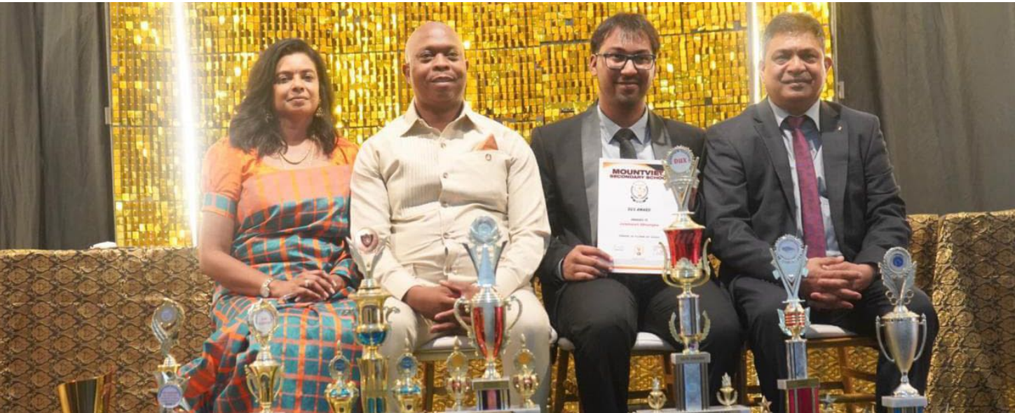
By: Philakahle Ngubane

The KwaZulu-Natal Department of Education joined Mountview Secondary School in celebrating the achievements of the Class of 2024 during the school's awards ceremony.