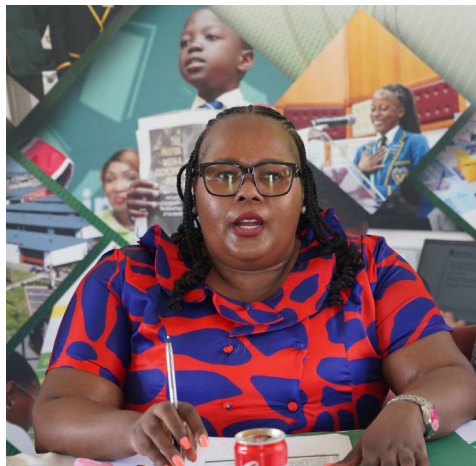
DDG WEZIWE HADEBE CONDUCTS SCHOOL FUNCTIONALITY MONITORING