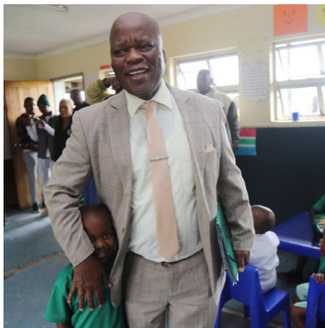
HOD CONDUCTS SCHOOL FUNCTIONALITY MONITORING