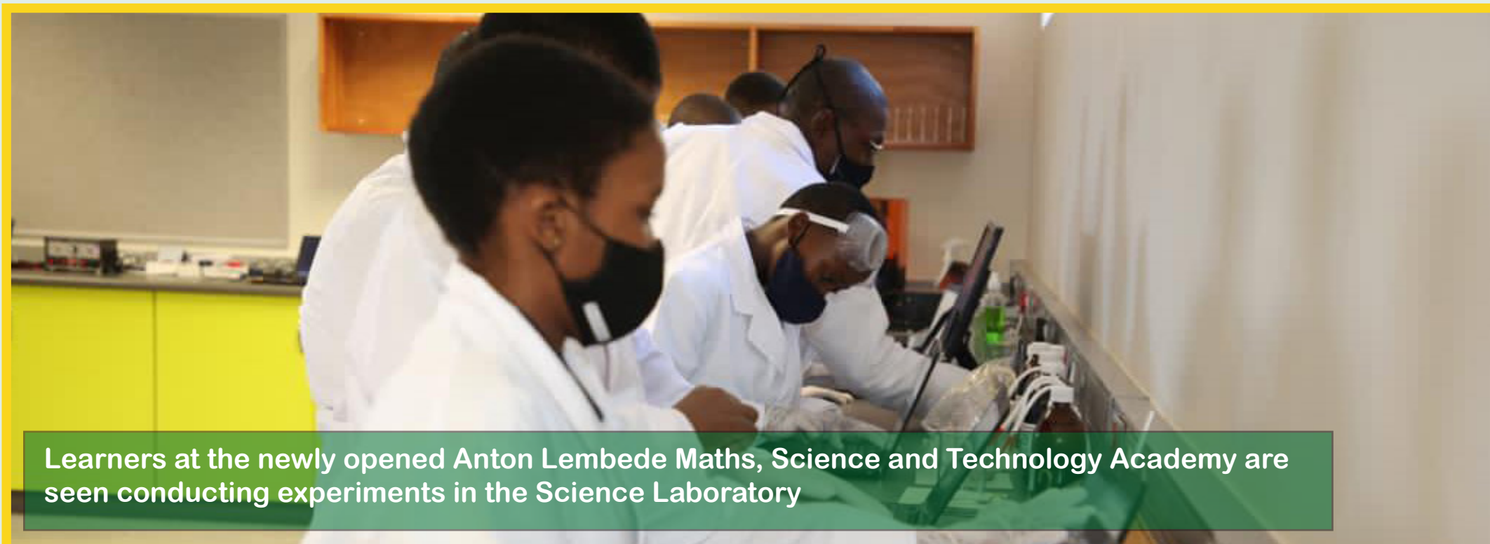
Learners at the newly opened Anton Lembede Maths, Science and Technology Academy are seen conducting experiments in the Science Laboratory