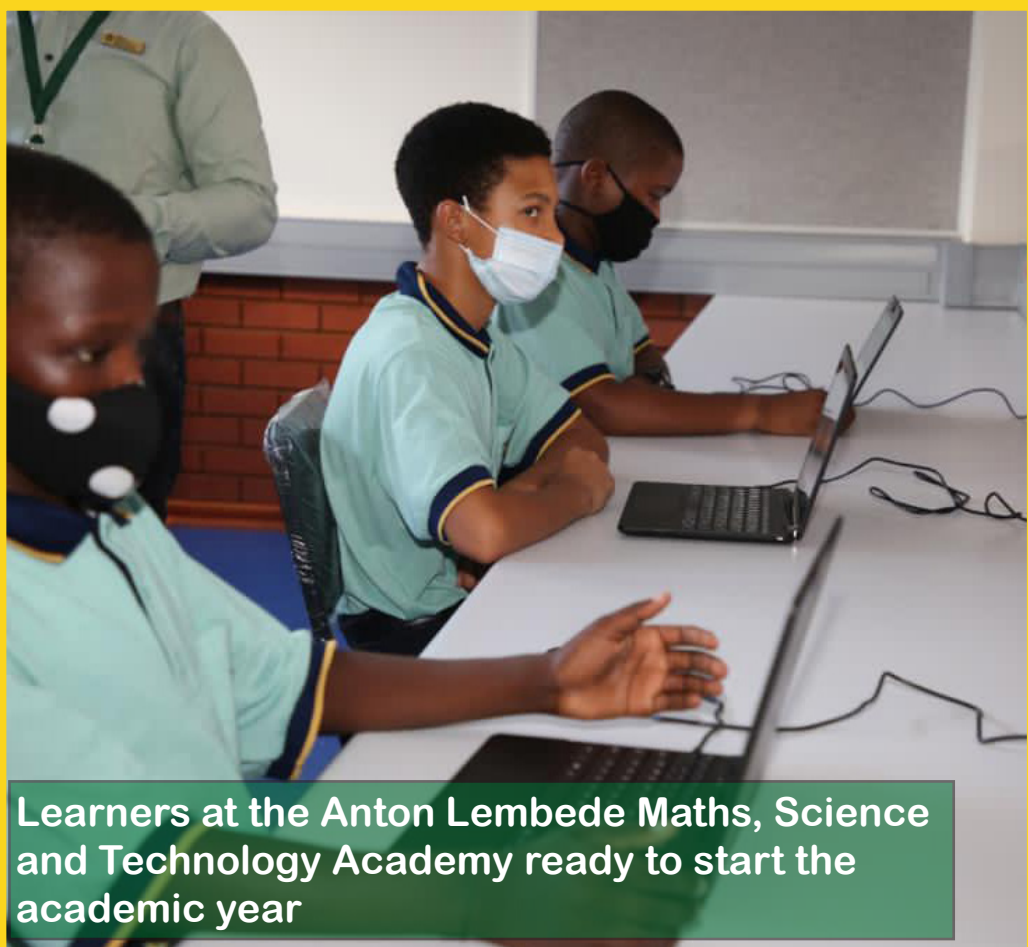
Learners at the Anton Lembede Maths, Science and Technology Academy ready to start the academic year