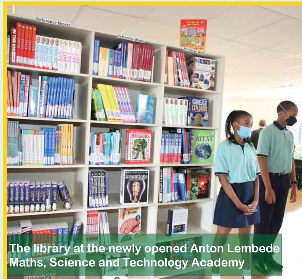
The library at the newly opened Anton Lembede Maths, Science and Technology Academy