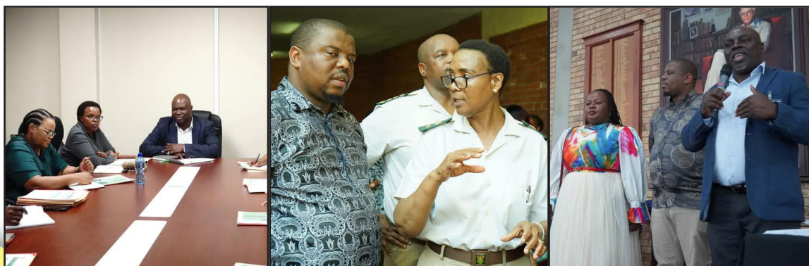
Addressing unemployment Grievances: A meeting with unemployed educators and the Premier's office