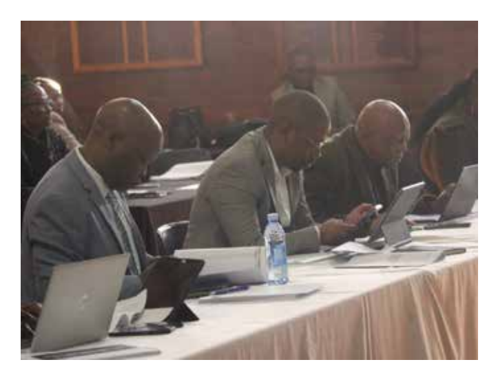
AMAJUBA DISTRICT VISIT