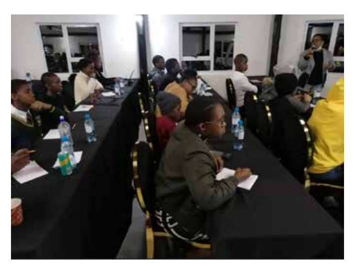
The Office of the Premier, under the status of Women and Children, conducted a 3 day Ambassador Programme in Dundee Battlefield.