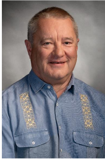
FRANCOIS RODGERS, MPL MEC FOR FINANCE