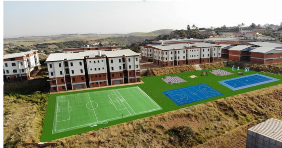
Artist's impression of proposed sports fields