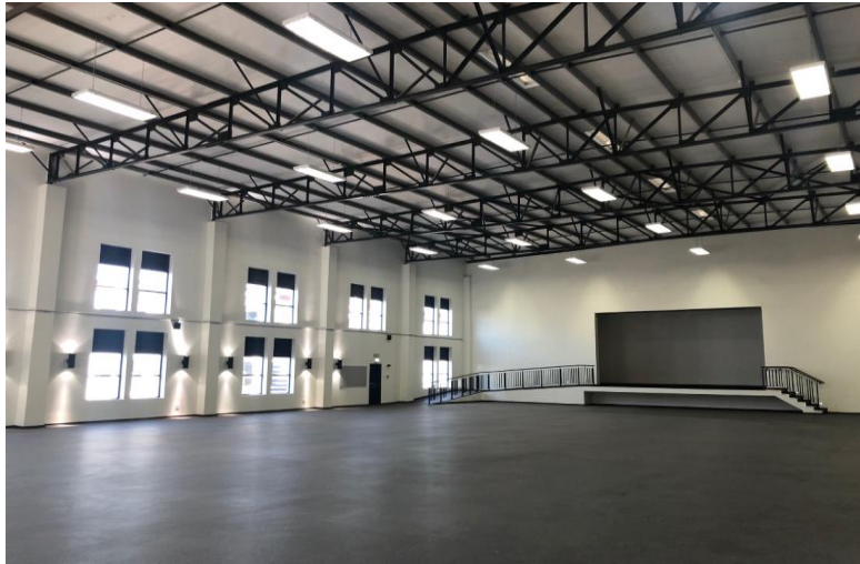
Existing Indoor Multi-Purpose Centre