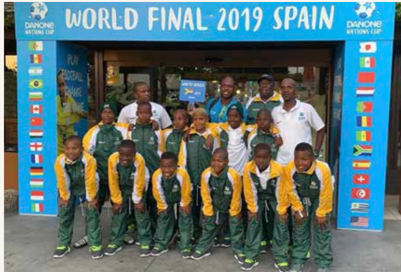
Opening Day Danone Nations Cup Soccer Tournament in Spain