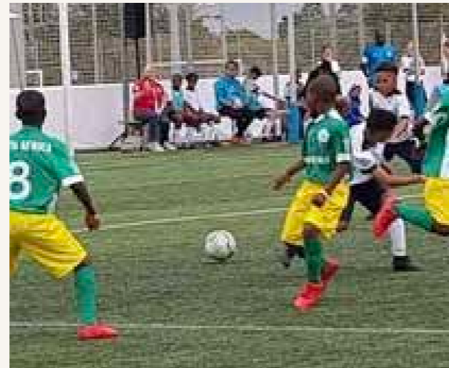
MZUVUKILE PRIMARY SCHOOL FROM NSELENI WON THE DANONE SOCCER CHAMPIONSHIP AND HAD REPRESENTED SOUTH AFRICA IN SPAIN.