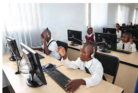
Figure 1 Learners in UThukela District experiencing interactive computers for the first time

To achieve synergy across the system and working with the Department of High Education, Science and Technology, we will engage the Tertiary Institutions in the province to also offer in their curriculum subjects such as Coding, Robotics and others that are in line with the demands of the 4IR. During this financial year, we will also convene a colloquium with international experts to discuss about industries of the future so that products of our schooling systems are relevant for the future.