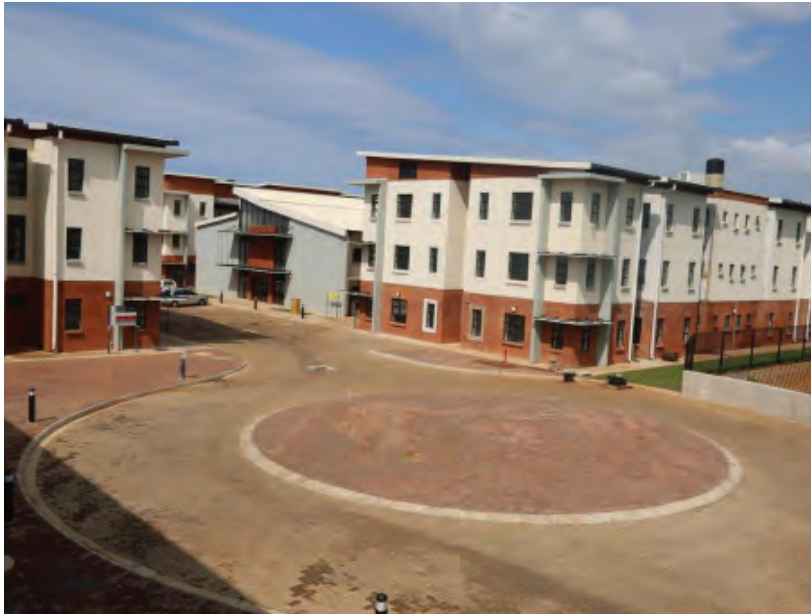
Figure 4 La Mercy Maths and Science Academy to be opened soon

In spite of very limited infrastructure budget for 2019/2020, we have allocated R2, 5 billion for the infrastructure programme. We must register our concern that while we continue to see a decline in infrastructure dedicated budget, there continues to be a rise in the cases of vandalism, theft of and damage to our school infrastructure. It should be noted that the Department will find it very difficult to allocate any budget towards repairs as a result of deliberate damage to school infrastructure. As we stated above, we call upon all communities to value and protect their schools from criminal elements.