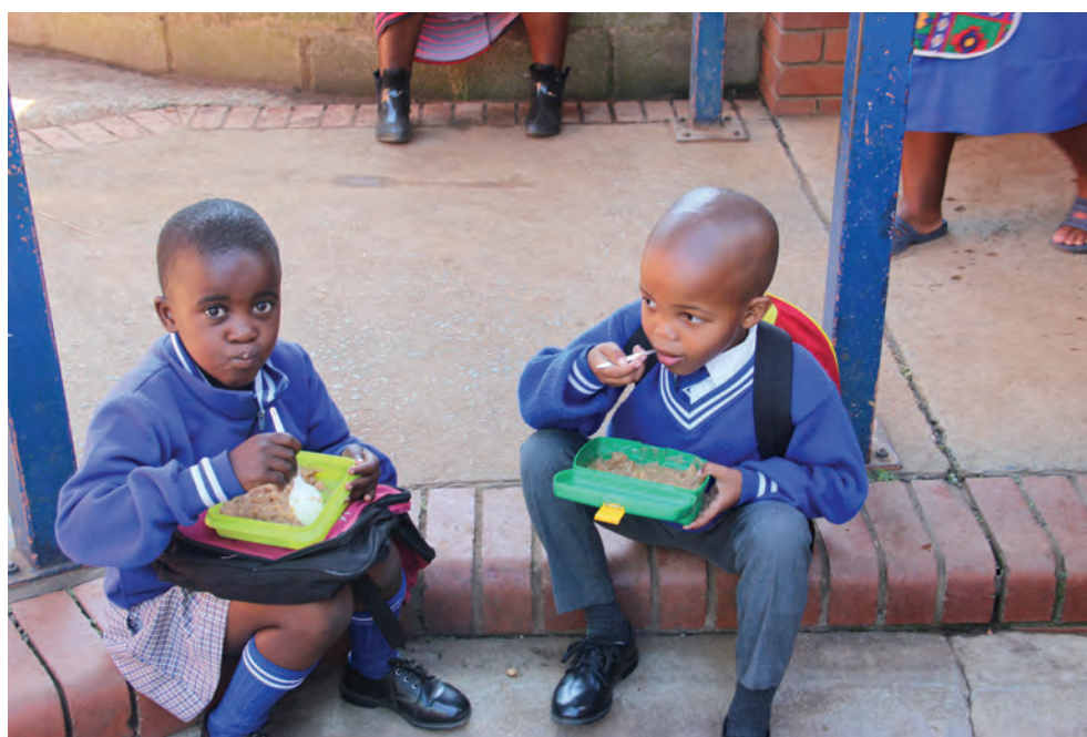
Figure 3 School Nutrition Program throughout the province of KwaZulu-Natal

Contributing to job creation, the programme employs 1 527 Chief Food Handlers in selected participating schools through Expanded Public Works Programme (EPWP) Incentive Grant to supervise daily implementation of the programme and 14 521 Volunteer Food Handlers who prepare meals for the learners.