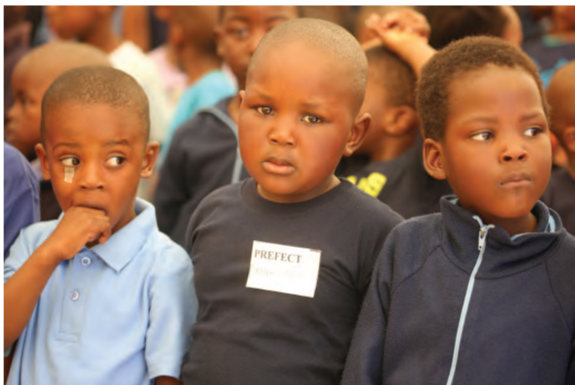
Figure 5 Grade R learners in UMgungundlovu District

In the near future, ECD (0 – 4 year old) will be transferred from the Department of Social Development (DSD) to our Department ( DoE ). Currently, the Department is participating in the Inter-ministerial task team set by the Minister of Basic Education. Depending on clear definition of policy by the National Department, the timelines are indicating that this programme will fully materialise in the year 2030. As of now, the province is focussing on making provisions for the training of Practitioners in order for them to acquire the relevant qualification in preparation for the takeover.