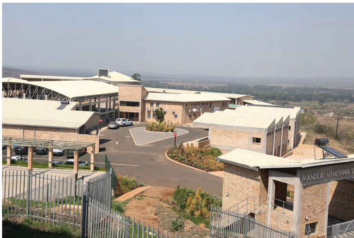
Figure 2 Transforming schools in the rural area like Mandla Mthethwa

The position of the department is to close down such schools and move learners to viable schools. Moving learners to other schools will require scholar transport or hostel facilities. The pace of rolling out this programme depends on the availability of funds, which the department will have to source through reprioritization from the allocated baseline.