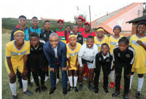
Figure 6 MEC Kwazi Mshengu with participants from various provinces during the 2019 winter games

We are driven by the conviction that a healthy mind resides in a healthy body!