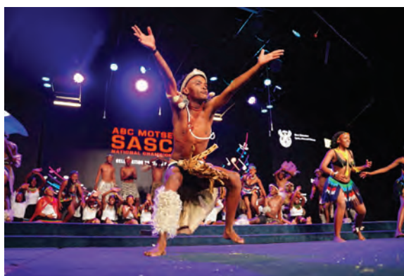
Figure 7 Participants representing KZN in the 2019 SASCE