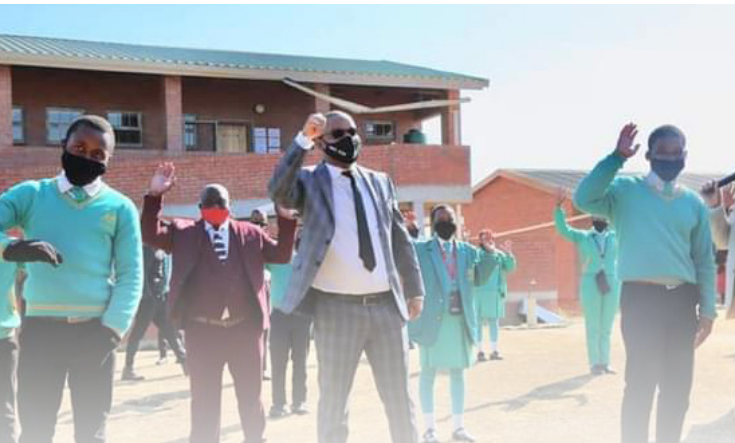
KwaZulu Natal Department of Education launched the eLearning Gamma Solution Project at uBulinga Secondary