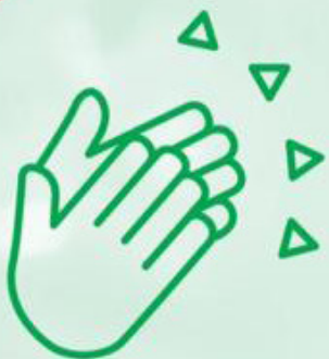
KWAZI MSHENGU MEC FOR EDUCATION IN KZN

“TEACHERS ARE THE FOUNDATION OF EVERY SUCCESSFUL NATION”