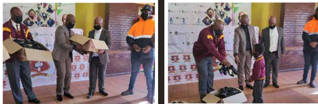
Hand-over of school shoes to learners

The donation which was made by DG, CEOs and Senior Managers of implenting agents, took place at the Umzinyathi District Office, on 31 May 2022.