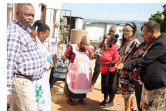
DEPUTY MINISTER VISITS NTUZUMA PRIMARY SCHOOL

The purpose of the visit was to offer any assistance needed by the school and handover 130 school shoes and 250 lunch bags to deserving learners after the flood that left many homeless and distraught.