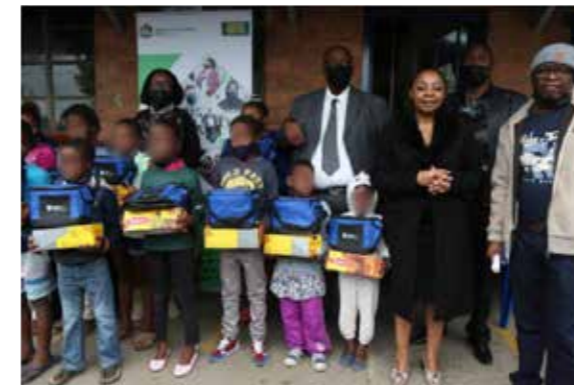
HANDING OVER CEREMONY AT COM-TECH

The purpose of the visit was to offer any assistance needed by the school and handover 130 school shoes and 250 lunch bags to deserving learners after the flood that left many homeless and distraught.