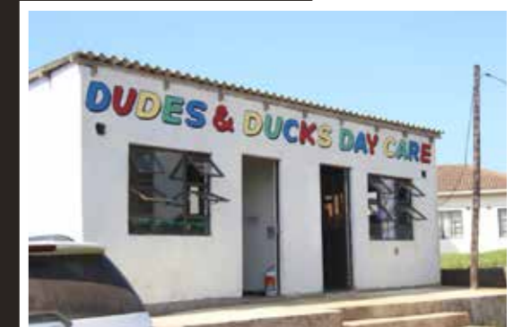
VISIT TO ECD CENTRES BY THE DEPARTMENT OF BASIC EDUCATION