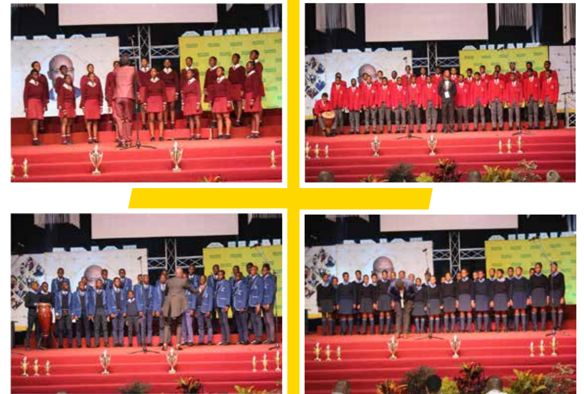
ABC Motsepe SASCE Provincial Competition

The KZN Department of Education hosted the ABC Motsepe SASCE Provincial Competition in the Secondary Schools categories, that took place at the Bethsaida Ministries International in Phoenix, Friday, 27 May 2022.