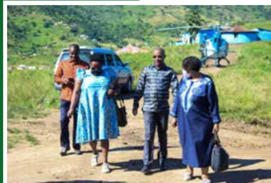
MINISTER & MEC VISIT OF FLOOD DAMAGED SCHOOLS